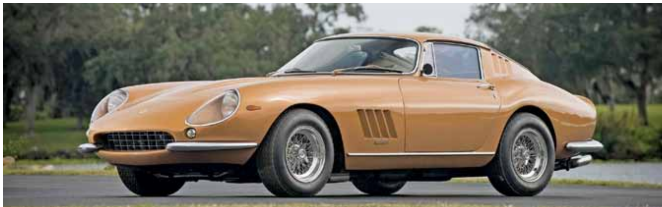
1967 Ferrari 275 GTB/4 at RM Amelia