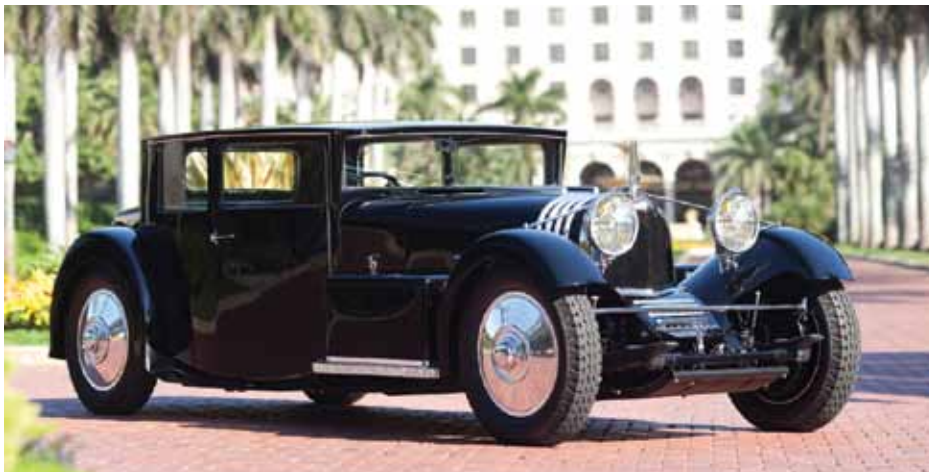
1931 Voisin C20 at Gooding Amelia

Browse the online version of Gooding's catalog at www.goodingco.com/auction .