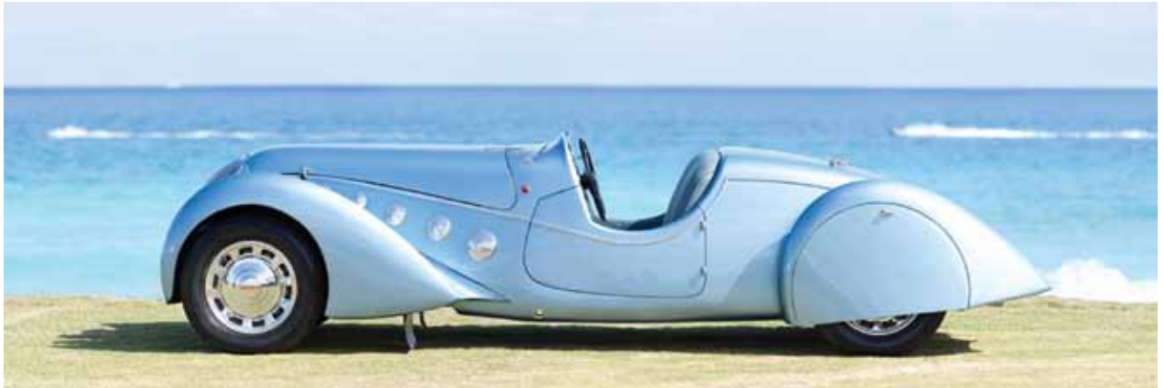
1938 Peugeot 402 Darl'Mat at Gooding Amelia