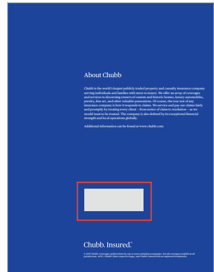
Back cover of the Protection Outlook and Annual Checklist

Note that the only places in the documents that need to be edited are at the bottom right of the checklist and the bottom right last page of the Protection Outlook and Annual Checklist (marked in red):