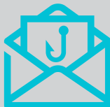
Email Message Header can display a different, fraudulent sender

When a recipient opens an email, the software displays the message – but hides the envelope header. This provides an opportunity for cyber criminals to assume the identity of anyone they think might facilitate a payment.