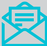
Email Message Header